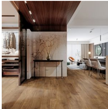
Rustic Oak Brown 7.8"x48.6" | Fibrano w/ HydroWood