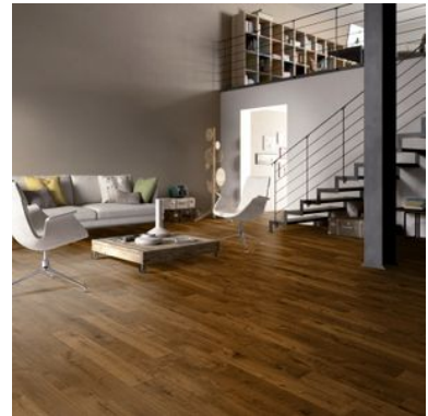
Savanah Oak Cedar 7.8"x48.6" | Fibrano w/ HydroWood