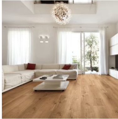
Cognac Oak 7.8"x48.6" | Fibrano w/ HydroWood