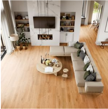
American Red Oak 7.8"x48.6" | Fibrano w/ HydroWood