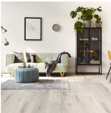
Northern Oak White 7.8"x48.6" | Fibrano w/ HydroWood