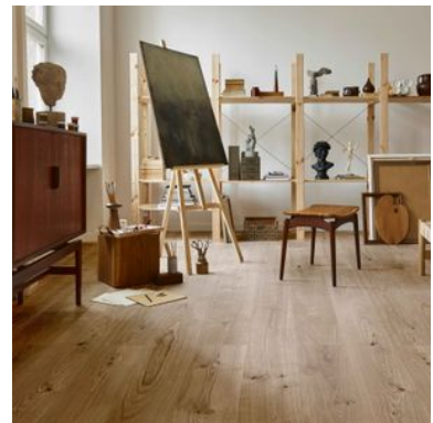
Oak Sevilla Taupe 7.8"x48.6" | Fibrano w/ HydroWood