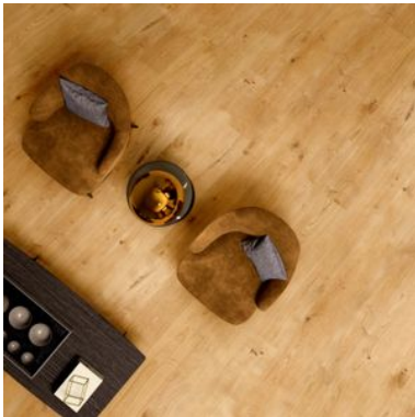
Oak Villa Gold 7.8"x48.6" | Fibrano w/ HydroWood