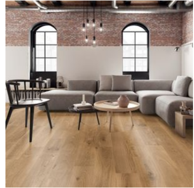
Kaya Oak Wellington 7.8"x48.6" | Fibrano w/ HydroWood