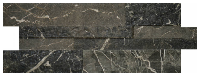
Dante Nero 6X16 6"x16" | Porcelain