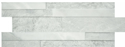
Manzoni Grigio 6X16 6"x16" | Porcelain