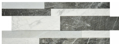
Venezia Mix 6X16 6"x16" | Porcelain