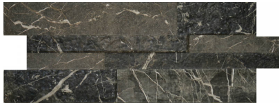
Dante Nero 6X16 6"x16" | Porcelain