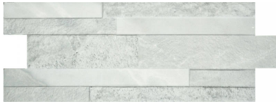
Manzoni Grigio 6X16 6"x16" | Porcelain