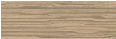
Mayari Concept Root Titanium Rect | 12"x36" Ceramic NEW