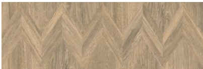
Mayari Concept Symmetry Titanium Rect | 12"x36" Ceramic NEW