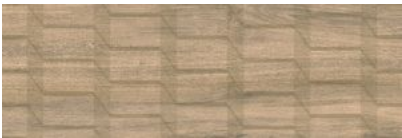
Mayari Concept Moving Titanium Rect | 12"x36" Ceramic NEW