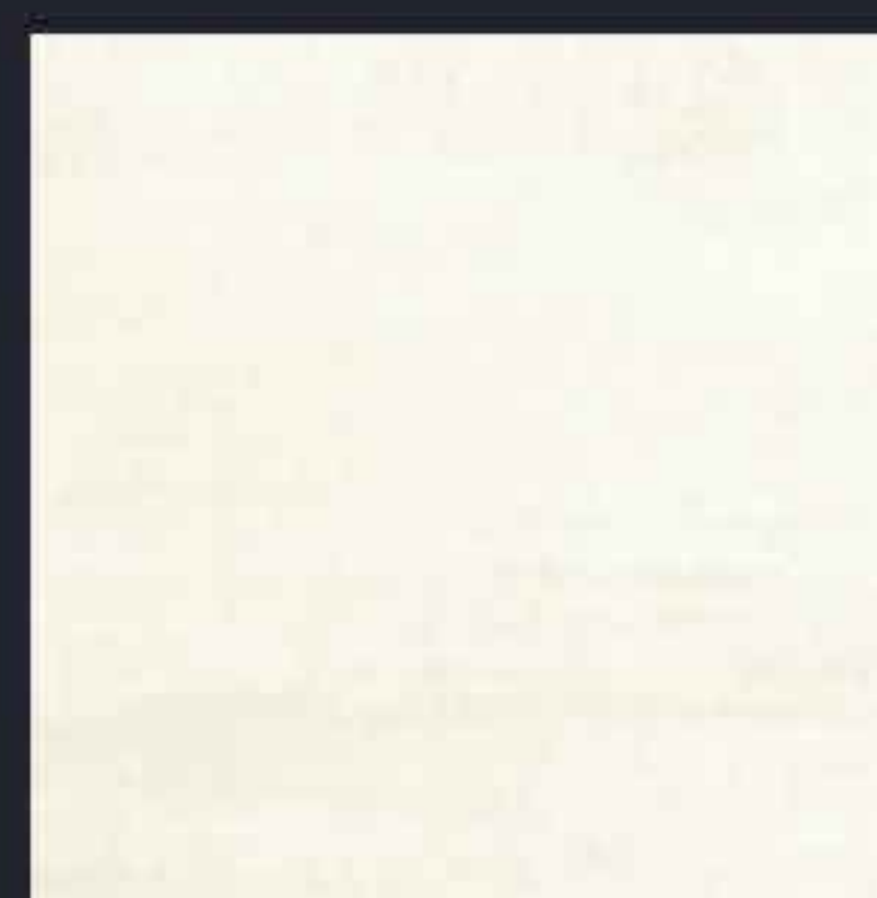
18X18 (ALSO AVAILABLE IN ANTI-SLIP)