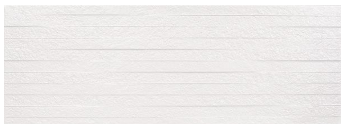
CER SERENA STONE WHITE 25X60 MAG1010L36I421010