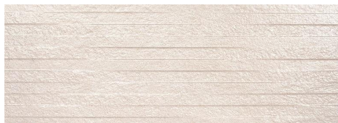
CER SERENA STONE BONE 25X60 MAG1010L36I421560