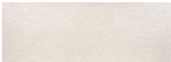
CER SERENA BONE 25X60 MAG1010L36I420560