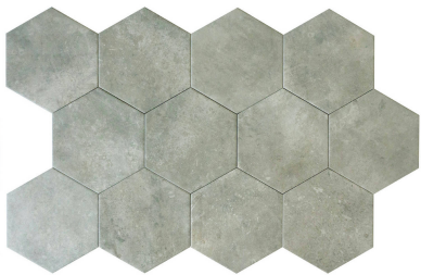
Seville 5.5X6.3" Grey Hexagon 5.5"x6.3" | Porcelain