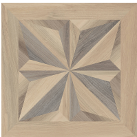
Tahoe Honey 24X24 24"x24" | Porcelain