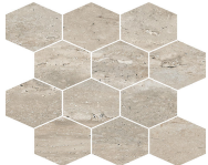
Saturnia 3x3 Hex Navona Matte 9"x11" | Porcelain