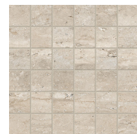
Saturnia 2x2 Mosaic Navona Matte 12"x12" | Porcelain