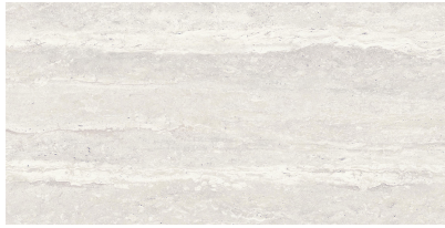
Saturnia 24x48 Roman Matte 24"x48" | Porcelain