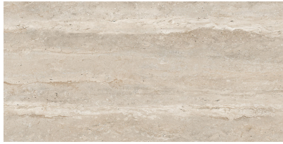
Saturnia 24x48 Navona Matte 24"x48" | Porcelain