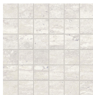
Saturnia 2x2 Mosaic Roman Matte 12"x12" | Porcelain