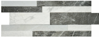
Venezia Mix 6X16 6"x16" | Porcelain