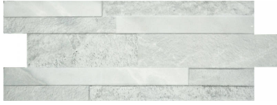
Manzoni Grigio 6X16 6"x16" | Porcelain