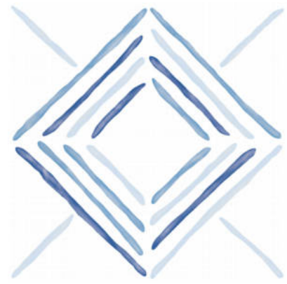
Falmouth 9x9 9"x9" | Glazed Porcelain