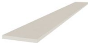
Marmiline Ash 4x36 Niche Sill 4"x36" | Engineered Stone