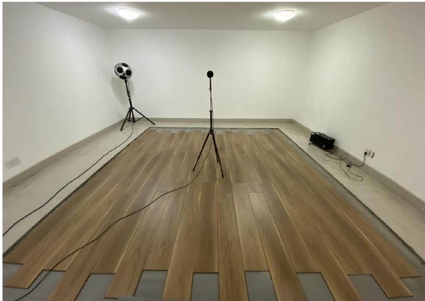
Test set up