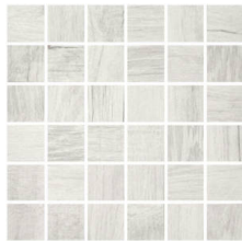
2X2 Sterling White Mosaic 12"x12" | Porcelain