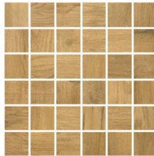
2X2 Acadia Natural Mosaic 12"x12" | Porcelain