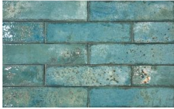
Jamaica Teal 3x11 3"x11" | Porcelain