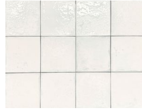
Jamaica White 5x5 5"x5" | Porcelain