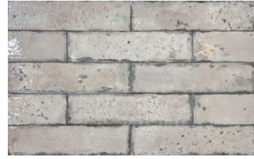
Jamaica Grey 3x11 3"x11" | Porcelain