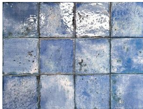
Jamaica Blue 5x5 5"x5" | Porcelain