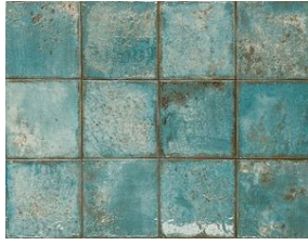
Jamaica Teal 5x5 5"x5" | Porcelain