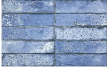
Jamaica Blue 3x11 3"x11" | Porcelain