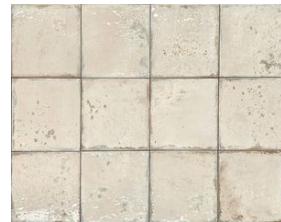
Jamaica Cream 5x5 5"x5" | Porcelain