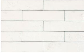
Jamaica White 3x11 3"x11" | Porcelain