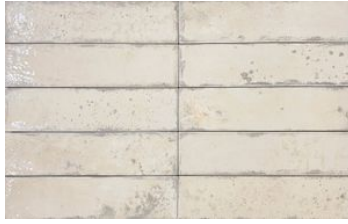
Jamaica Cream 3x11 3"x11" | Porcelain