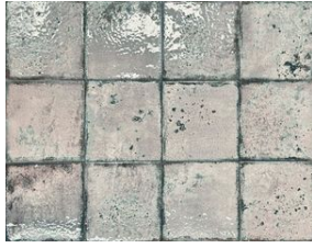
Jamaica Grey 5x5 5"x5" | Porcelain