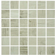
Whitebark Pine 2X2 Mosaic 11"x11" | Porcelain