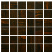
American Basswood 2X2 Mosaic 11"x11" | Porcelain