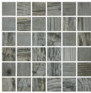
Pacific Fir 2X2 Mosaic 11"x11" | Porcelain