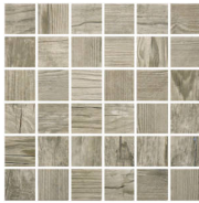
Silver Falls 2X2 Mosaic 11"x11" | Porcelain