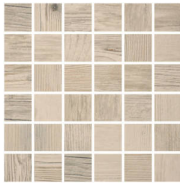
Paradise 2X2 Mosaic 11"x11" | Porcelain